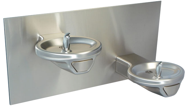
** U.S. DESIGN PATENT D545,607