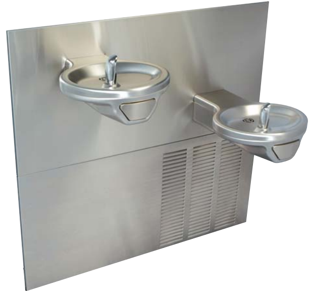
** U.S. DESIGN PATENT D545,607