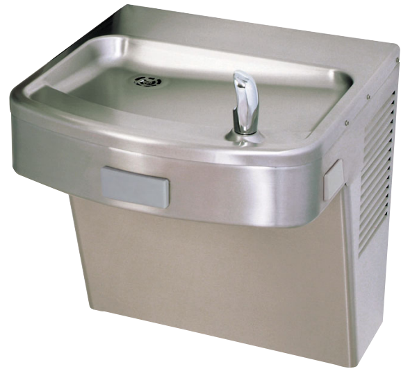
Model A111408S Shown